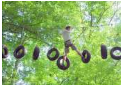
HIGH ROPES COURSE