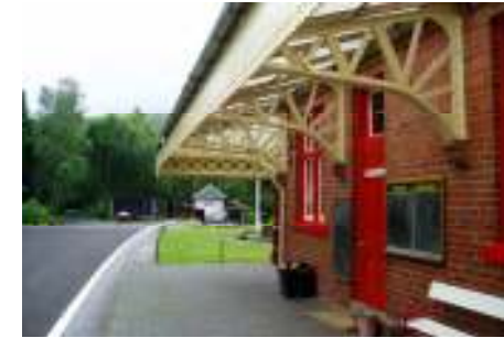
THE VIEW FROM THE STATION PLATFORM