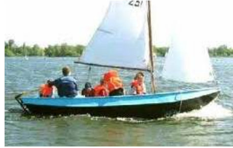
SAILING ON LOCH EARN