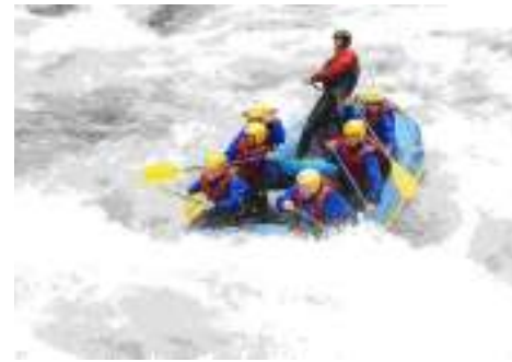
WHITE WATER RAFTING

DON'T MISS OUT: SIGN UP BY 31ST OCTOBER!