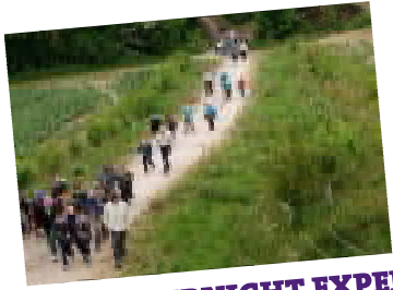
OVERNIGHT EXPEDITION — STAYING IN THE HILLS

Whilst in Lochearnhead, participants will be able to take part in a range of exciting and adventurous activities depending on their age and ability. This is not an exhaustive list and may be subject to change. Participants will take part in a mixture of activities below. The programme will vary for Scouts, Explorer Scouts and Scout Network members.