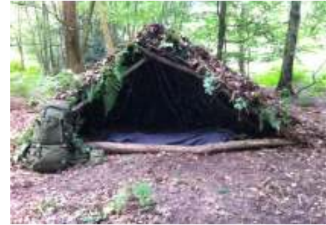
SHELTER BUILDING & BUSHCRAFT