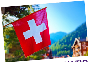
CELEBRATE THE SWISS NATIONAL DAY 1ST AUGUST