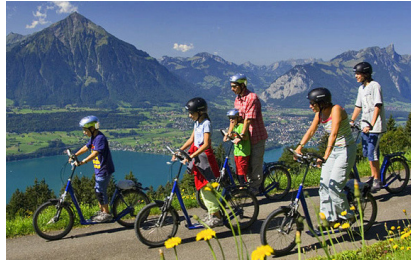
TROTTI BIKING DOWN THE MOUNTAIN