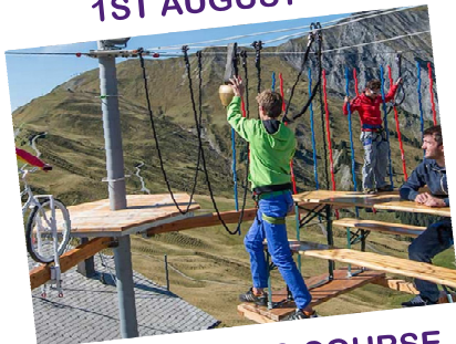
HIGH ROPES COURSE