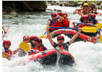
WHITE WATER RAFTING

DON'T MISS OUT: SIGN UP BY 25TH September!