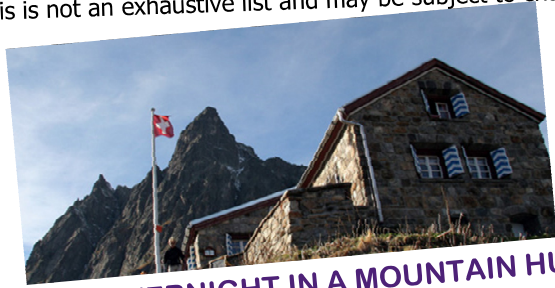
STAY OVERNIGHT IN A MOUNTAIN HUT

This is not an exhaustive list and may be subject to change. Participants will have a degree of choice over some of the activities, with the option to choose more active or gentle options.