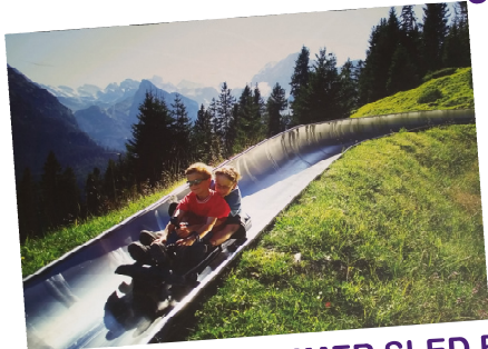
RODELBAHN - SUMMER SLED RUN