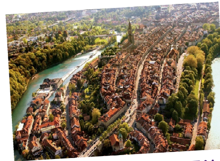
VISIT BERN - THE CAPITAL CITY OF SWITZERLAND