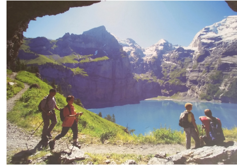
WALKING IN THE ALPINE MOUNTAINS