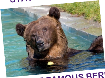
VISIT THE FAMOUS BERN BEARS