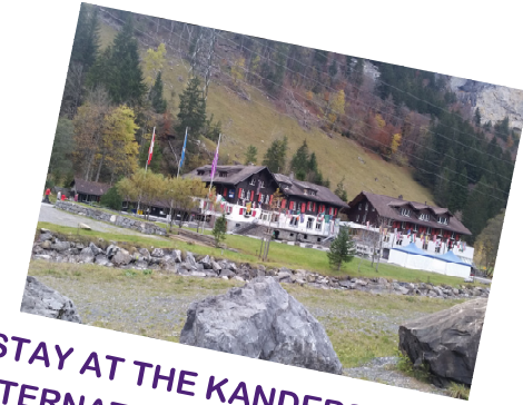
STAY AT THE KANDERSTEG INTERNATIONAL SCOUT CEN-