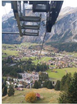
CABLE CAR RIDE TO LAKE OESCHINEN