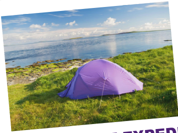
OVERNIGHT EXPEDITION — STAYING IN THE HILLS OR ON AN ISLAND

Whilst in Lochearnhead, participants will be able to take part in a range of exciting and adventurous activities depending on their age and ability. This is not an exhaustive list and may be subject to change. Participants will take part in a mixture of activities below. The programme will be varied by ability, confidence and experience in each activity.