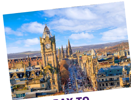
A DAY TO EXPLORE EDINBURGH