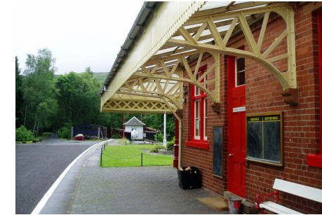
THE VIEW FROM THE STATION PLATFORM